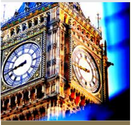
The programme commences every September & January