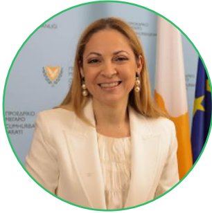
Anna Koukkides – Prokopiou Minister of Justice and Public Order of the Republic of Cyprus