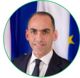
Harris Georgiades Former Minister of Finance of the Republic of Cyprus, Chair of the House Standing Committee on Foreign & European Affairs